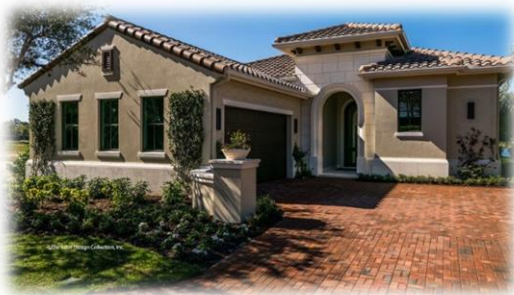
Contemporary Architectural Style

Full video documentation of, the construction, the materials, the teams, that built your new home