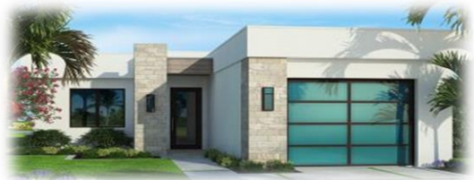
Modern Architectural Style