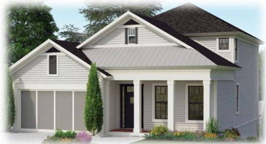
Traditional Architectural Style