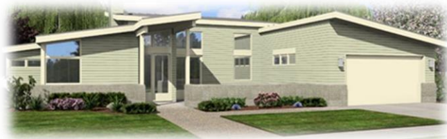
Mid-Century Modern Architectural Style